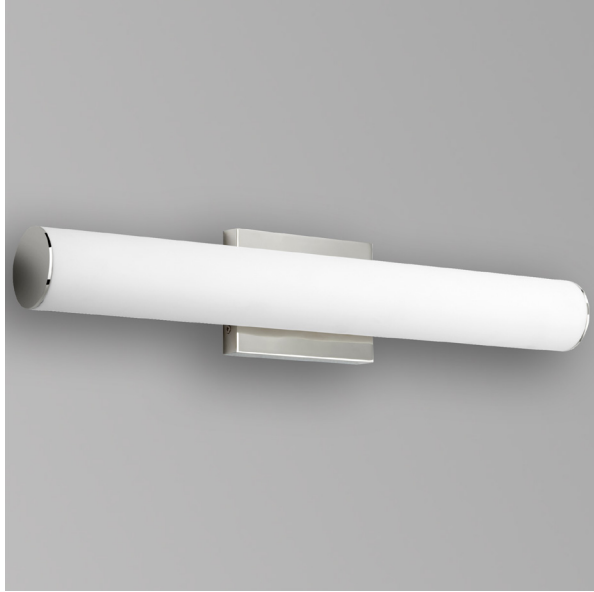
-20 Polished Nickel